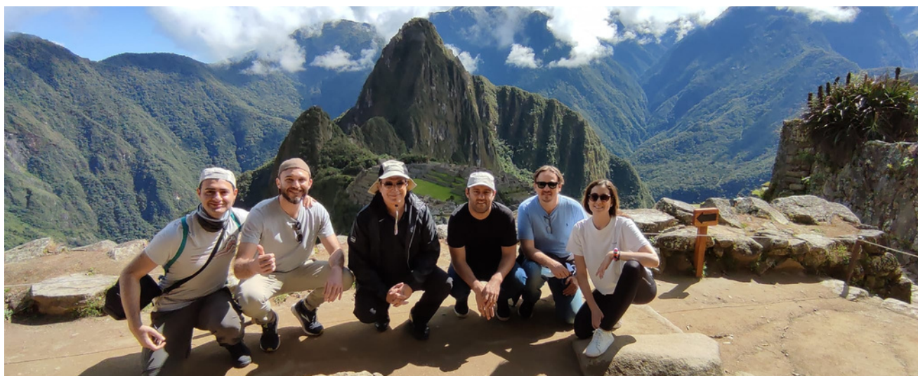
MACHU PICCHU SANCTUARY. WE MADE IT!

In upcoming dates, the final adoption of CPG for Peru will be a reality, and we recommend that MDT discussion among doctors from different sarcoma hospitals in Peru will be scheduled for this important achievement. Thanks to Peruvian Colleagues for this unforgettable time.